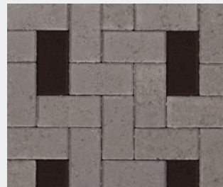
Black * †