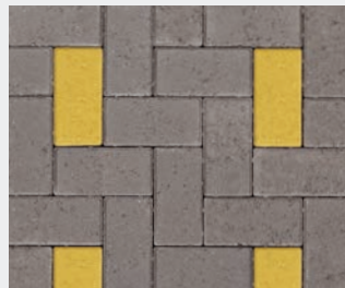
Yellow * †