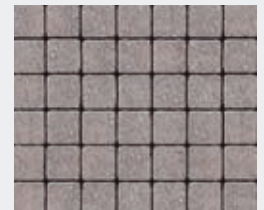
Truro * †