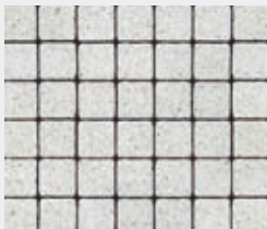
Cornish Silver Grey