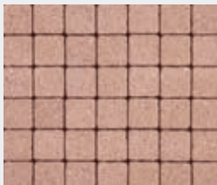
Braemar * †