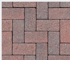
Lochnagar * †