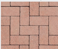
Braemar * †