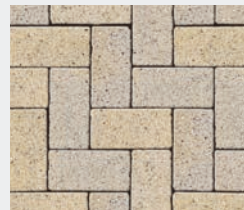
Victoria * †