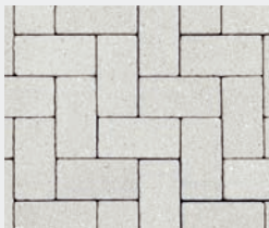
Cornish Silver Grey