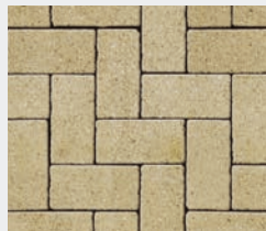
Tintagel * †